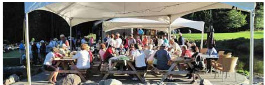
Participants at the 2016 BAF having a great time!

ible. $50,000.00 net profit. I defer to the foregoing BAF "trio" for further details of the event while I encourage everyone to support it a number of ways from entering to play, donating a prize for the auctions or by being a $300.00 JHS or a $50.00 Patron . Please check our website for details on being a JHS or a Patron , which in combination are two major sources of revenue which also allow non-golfers a way to support this essential bottom-line event.