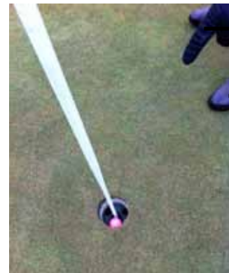
Indisputable proof of Jane's hole-in-one